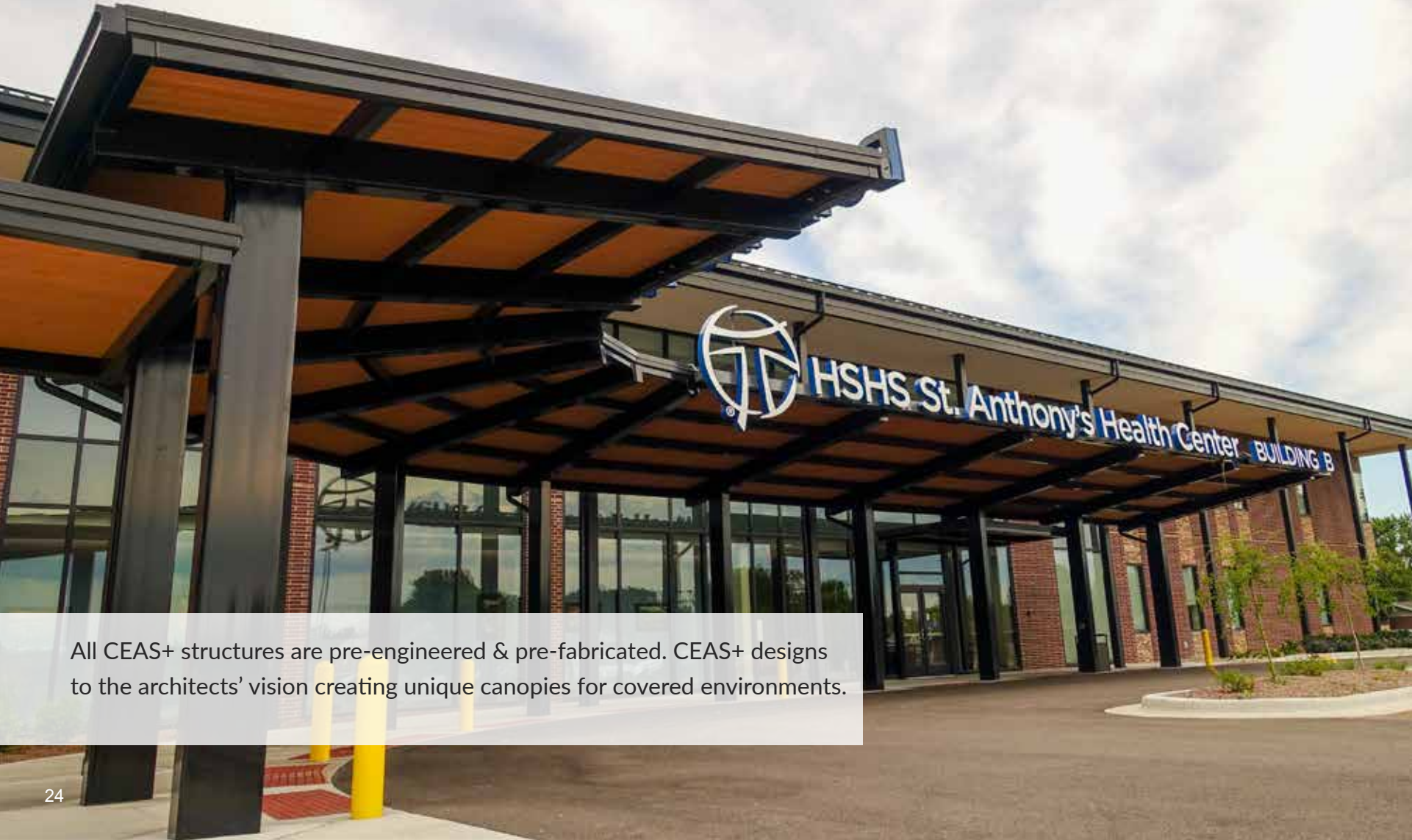
All CEAS+ structures are pre-engineered & pre-fabricated. CEAS+ designs to the architects' vision creating unique canopies for covered environments.